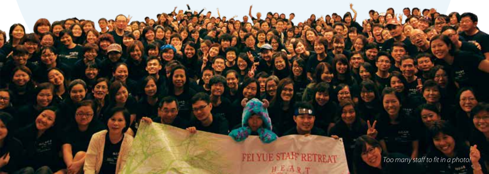
Too many staff to fit in a photo!