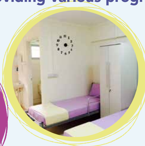
Senior Group Homes at Hougang and Teck Whye