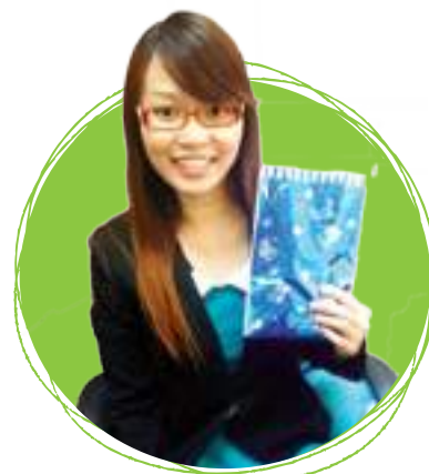
Here is last quarter's happy quiz winner!

Be the first participant to complete this word search correctly, send in your answers, along with your name, mailing address and contact number to apilding@fyys.org , and receive a special prize!