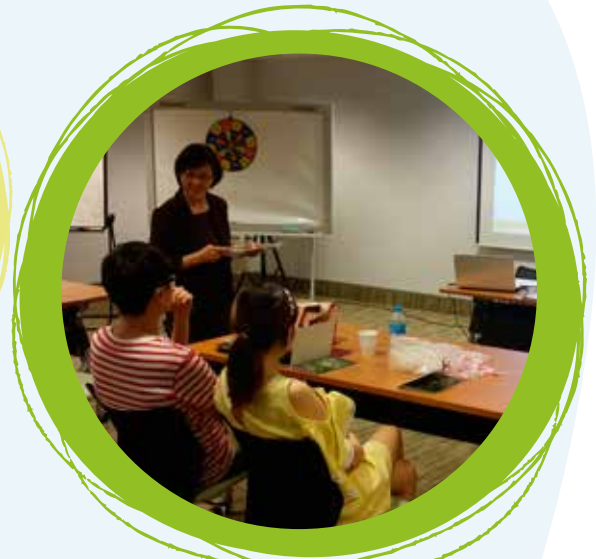
Transnational Family Support Services