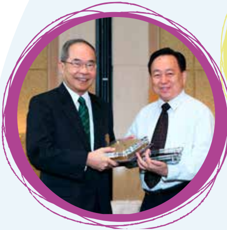
Business Excellence Certification